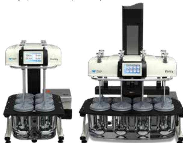
Vision G2 Classic 6 and Elite 8 Dissolution Testers