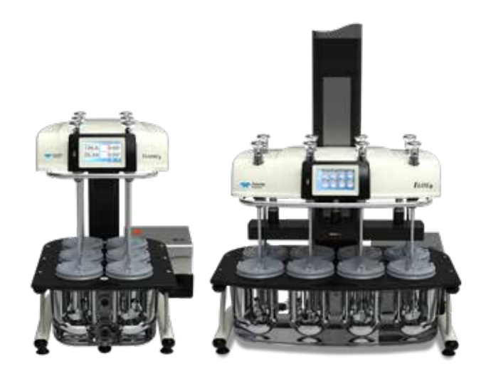
Vision G2 Classic 6 and Elite 8 Dissolution Testers