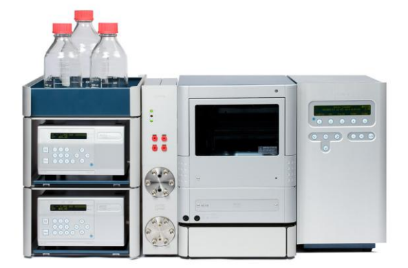
Fig 1. ALEXYS Phenols Analyzer.

The ALEXYS Phenols Analyser is routinely applied for analysis of environmental phenols. Phenols are analysed routinely using an isocratic or gradient LC system. Detection limits in the low PPB range are obtained. By using on-column sample concentration in combination with large volume in jection the detection limits are easily improved by a factor 10 - 100.