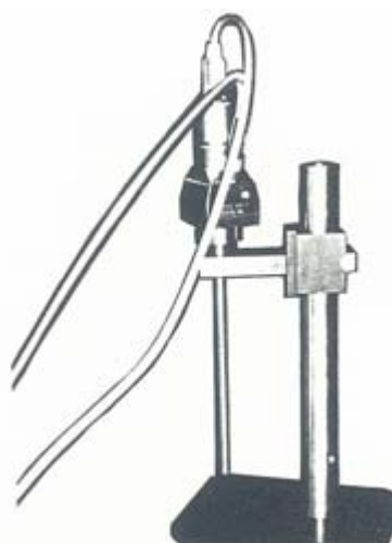
Fig.1 Diffuse reflection attachment

Figure 2 shows the NIR spectra obtained in the present experiment. The OH group at the 5200 \text{cm}^{-1} absorption band reveals a strong dependence on water content. Figure 3 shows the correlation between the water contents obtained using the proposed method and actual value obtained through the conventional water content measurement method for the wavelength range of 4900 - 5200 \text{cm}^{-1} . Multivariate analysis is widely used in food analysis to determine the individual components of a sample. Moreover, Modifications such as arranging sample particle diameters or controlling temperature and moisture can be applied to obtain better correlation results. However, due to the preliminary nature of the present study, no such modifications were performed in the present method. The results of present study show that multivariate analysis is a very effective method for determining an individual component when no information is available concerning the other components.