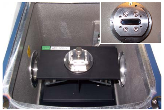
Figure 1: ATR-500/Mi+ATR crystal plate (Upper right: Prism and liquid cell)

Characterized by wavelengths longer than the mid-infrared region, the far-infrared region is also referred to as the terahertz region. In recent years, this region has been used to evaluate crystal polymorphs for pharmaceuticals and semiconductor device materials, as well as for archaeological research applications, including the study of inorganic pigments. Light in the far-infrared region (terahertz waves) corresponds to hydrogen bonding and Van der Waals forces believed to hold the key to an understanding of the functional expressions of and structural changes in biological molecules in liquids, as well absorption energy in hydrophobic interactions. as Calculations, generally theoretical, have been applied for such purposes in the past, but using light in the far-infrared region should allow the acquisition of important experimental information regarding such behavior.