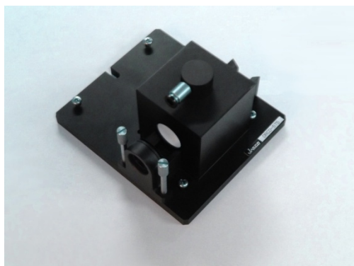
Fig. 1 Model DRCD-575 Powder CD Unit

Keywords: powder sample, amino acid, DRCD method