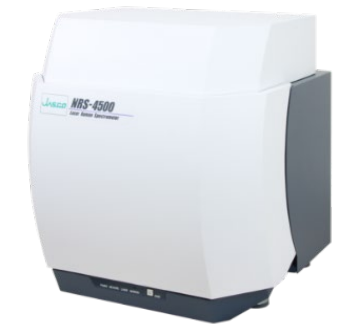
Fig. 1 NRS-4500 Laser Raman Spectrometer

In order to suppress denaturation of samples, a high-speed imaging function QRI (Quick Raman Imaging) was used, and laser irradiation time was minimized.